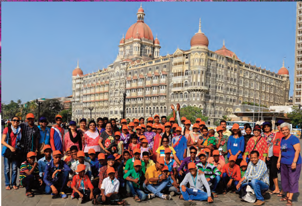
Tribal children's visit to Mumbai.